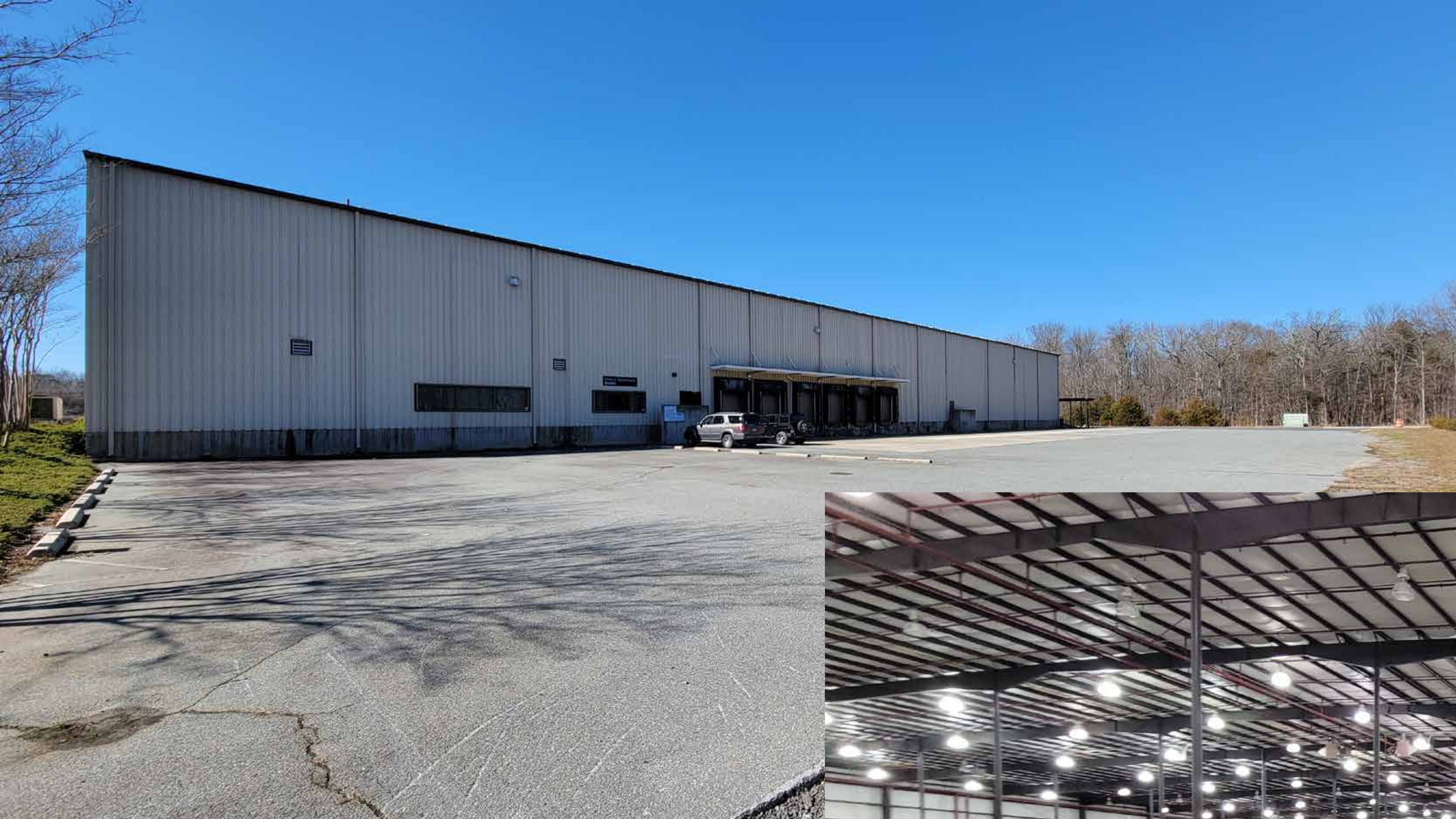
Exterior of Existing Warehouse